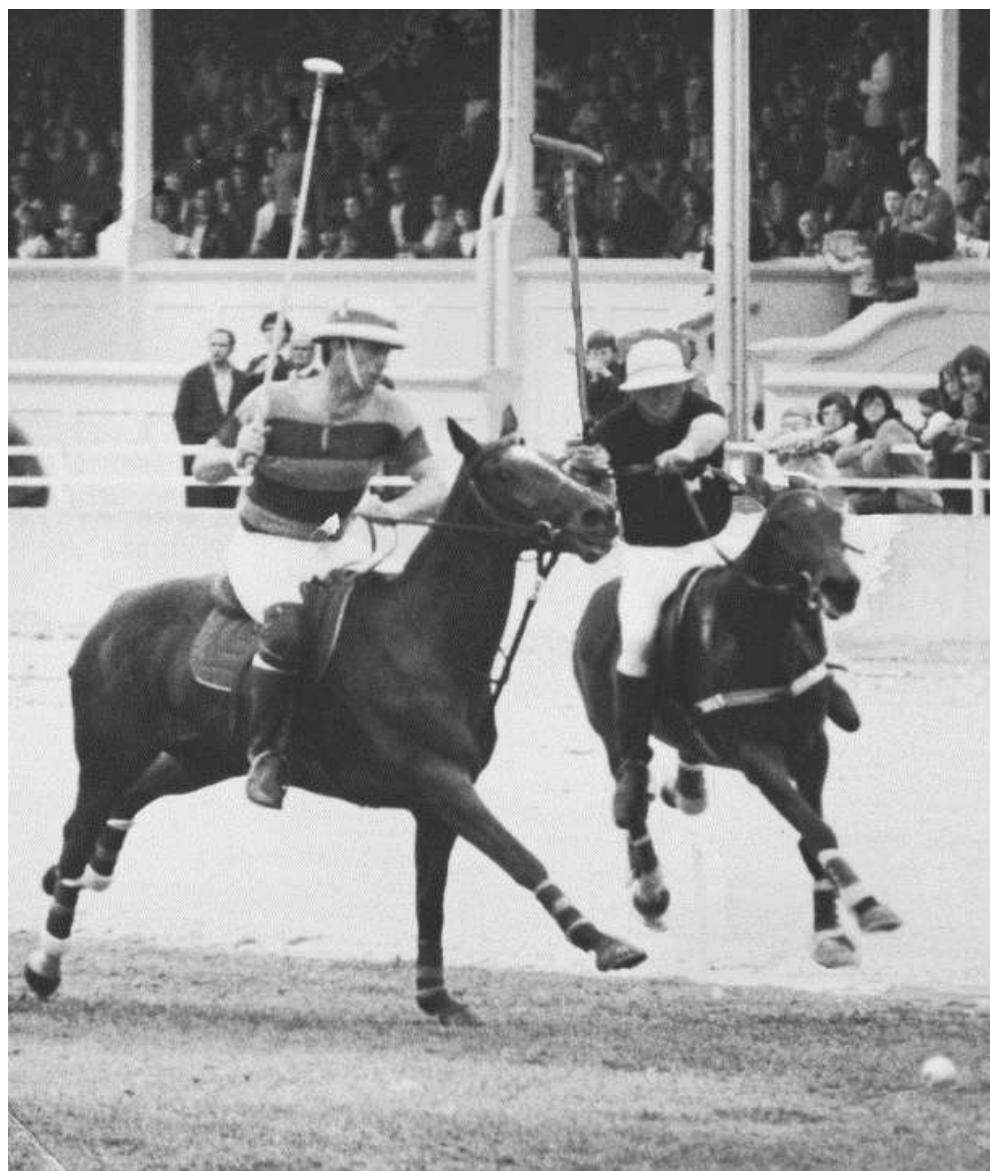
At Royal Melbourne Show, 1975, Melbourne Centenary Tournament.