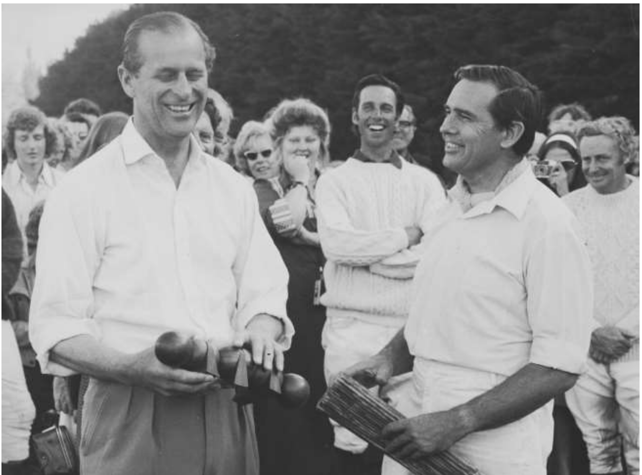
Wooden Balls Trophy presentation, 'Flowerfield', 1967